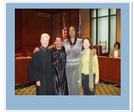
The Psychiatric Court Clinic's first two participants who successfully graduated from ASAC.

Close supervision of co-occurring participants is needed to identify when a medication is not working, as well as to help participants develop a plan for when medications do not work or when they are in crisis. Additionally, many participants had difficulty navigating the mental health systems alone. The Clinic provides direct access and monitoring so that participants do not have to do this alone. Participants need to have an Axis I mental health diagnosis in order to be accepted into the Clinic. The key elements of the PCC are: 1). Assessment and diagnosis of mental illness including: intake interview based on psychosocial, psychiatric and medical history; MSE and GAF scoring; continued evaluation of participant's diagnosis and how it changes with continued abstinence 2). Medication management and health education which includes finding the right medication; managing the participants response to medication; treatment planning; referral for case management; referral to group or individual counseling; and education to each participant about their diagnoses, symptom recognition and symptom management 3). Preparation for community integration including: monthly visits with participants who are