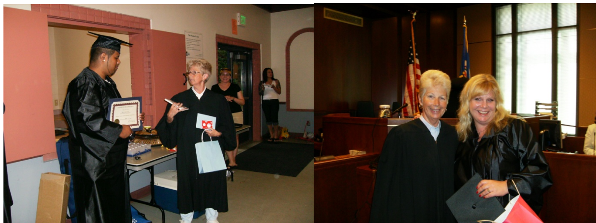
Pictured above are two of ASAC's 2008 graduates.